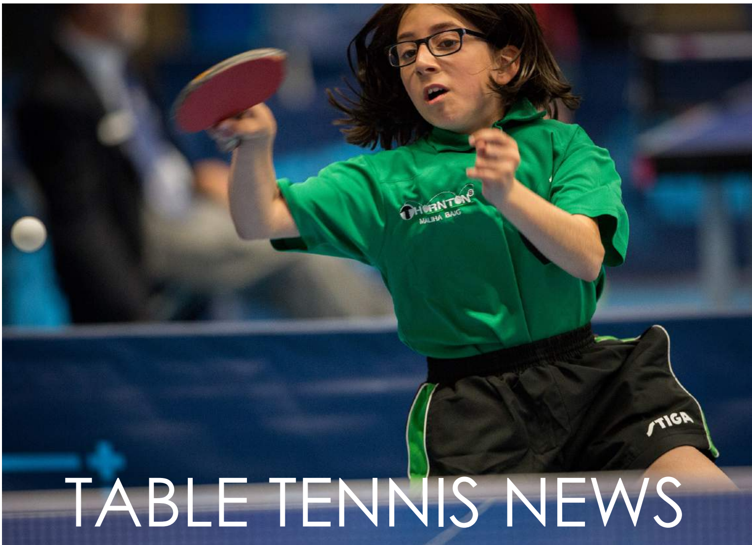
TABLE TENNIS NEWS