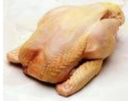
Whole Chicken (Fresh)