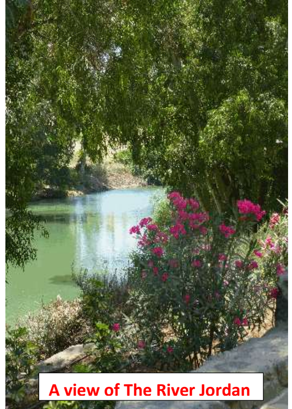
A view of The River Jordan

"YOU are my own dear child, I am pleased with YOU."