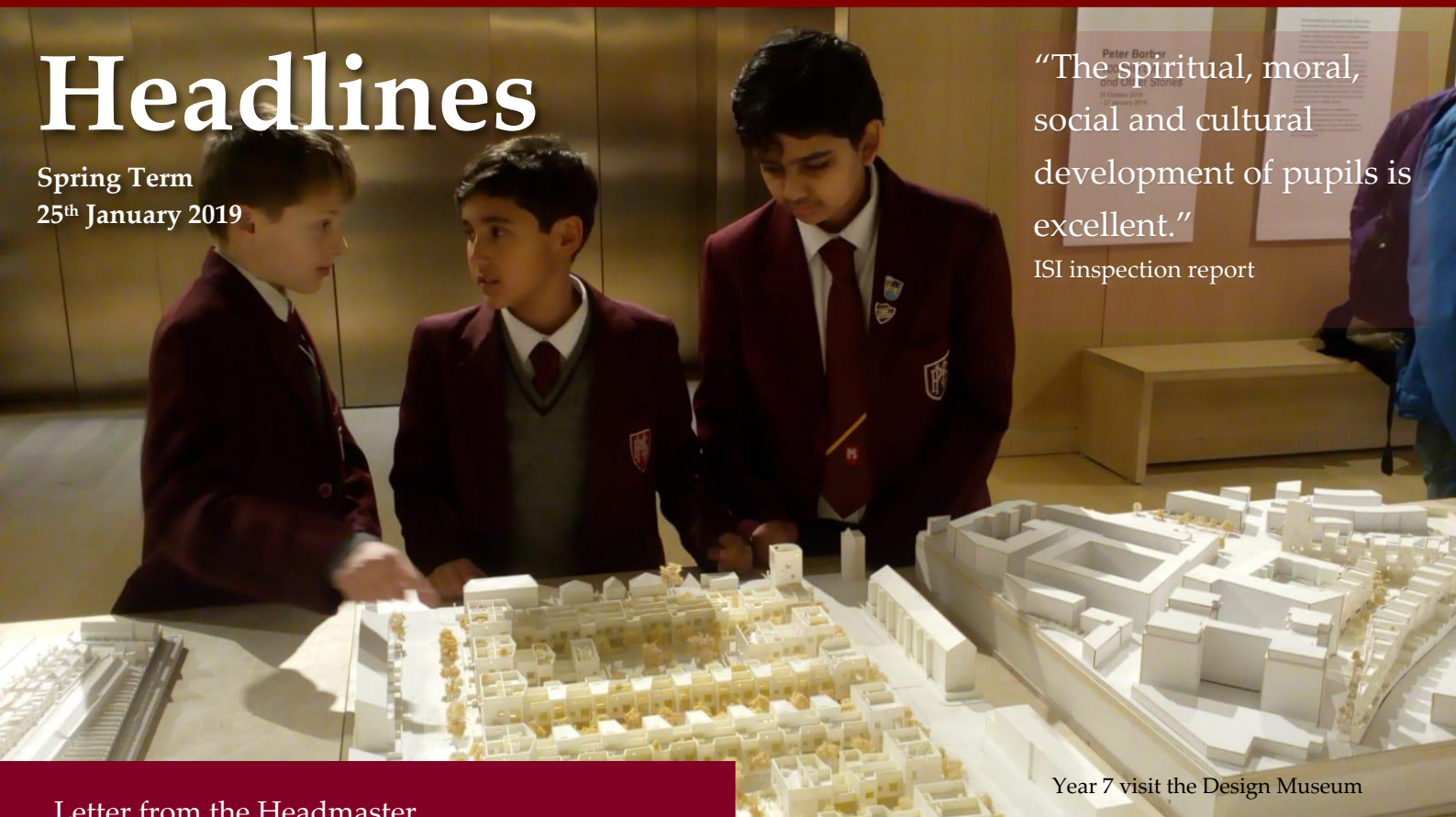
Year 7 visit the Design Museum