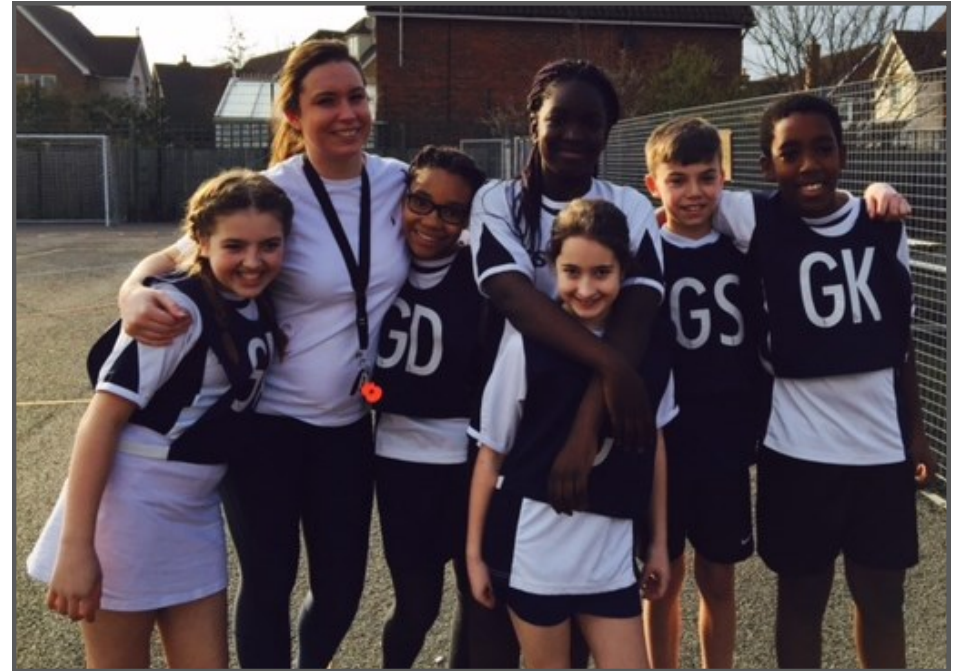
Congratulations Kenningtons Netball Team - 2016 Netball League Winners!

On Thursday afternoon, our netball team played our final league game of the year. With five out of five wins already under our belt we needed to win the last game to ensure that we won the league. After a tight first couple of minutes Kennington's started to find their feet and began to pull away. Eventually the game finished up Harris 0 - Kenningtons 19. Which has made us this year's netball league champions. The team have only conceded 5 goals all year and scored an impressive 96 goals in total as a team. So well done to all of the netball team for all of their hard work and dedication they have put in this year! They thoroughly deserved to win.