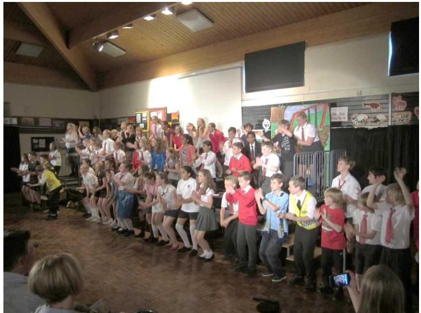
Year 6 Results and Whole School Progress