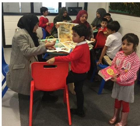
Remember to read every day!

It was fantastic to see so many parents attend the reading afternoon, where you had the chance to see our new library and read with your children.