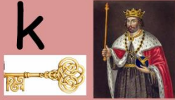
King keeps a key, k-k-k