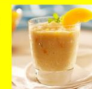
Yummy, yellow yoghurt, y-y-y