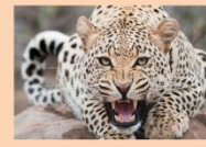
Laughing leopard, l-l-l