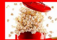
Popcorn popping, p-p-p