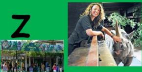
Zookeeper's zoo, z-z-z