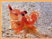
Orange octopus, o-o-o