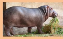
Hungry hippo, h-h-h