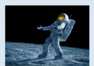
Mum on the moon, m-m-m