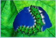
Caterpillars crunching, c-c-c