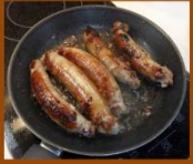
Sausages sizzling, s-s-s