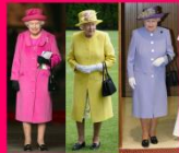
Queuing Queens, q-q-q