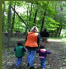
Walking in the woods, w-w-w