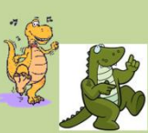
Dancing dinosaurs, d-d-d