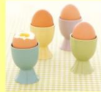
Eggs in the egg cups, e-e-e