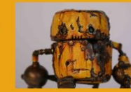
Rusty robot, r-r-r