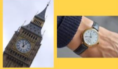
Tick tock time, t-t-t