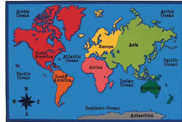
A map of the world.