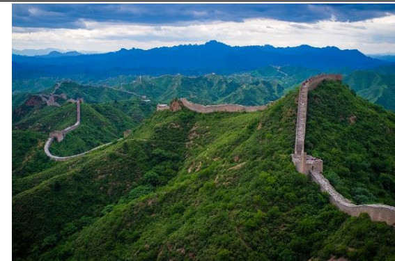
The Great Wall of China, China