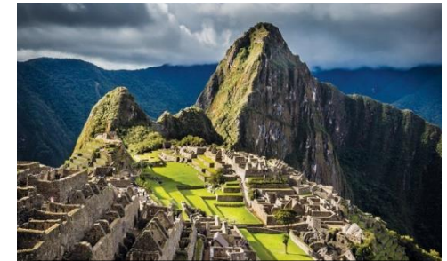
Machu Picchu, Peru