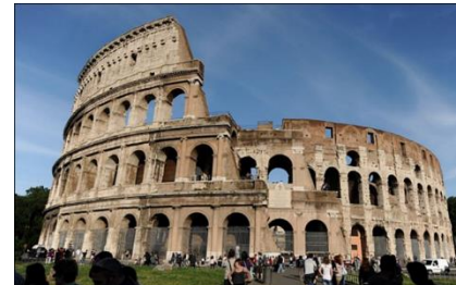
The Colosseum, Rome