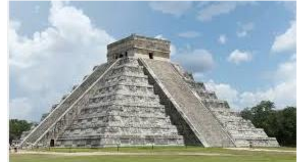
Chichen Itza, Mexico