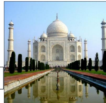
The Taj Mahal, India