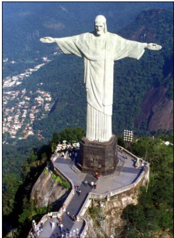
Christ the Redeemer, Brazil